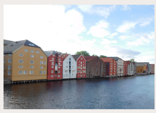
The piers in Trondheim. This row of buildings has immense national value, but their future use poses a challenge.

Non-physical traces are found in skills and know-how concerning the utilisation and development of cultural heritage. Examples of this would be choice of materials, traditional crafts, the utilisation and maintenance of artefacts and environs, and stories associated with physical artefacts. The concept of cultural heritage also includes procedures associated with the assessment and selection of archaeological and architectural monuments and sites, cultural environments and landscapes of significance for their inhabitants.