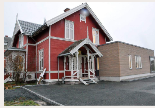
An extension in Levanger which severely impairs the heritage value of the former school principal's residence.