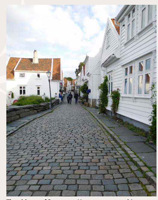
The old part of Stavanger. Homogeneous architecture also includes street paving, lighting and other street furniture that are important to provide for in urban development.