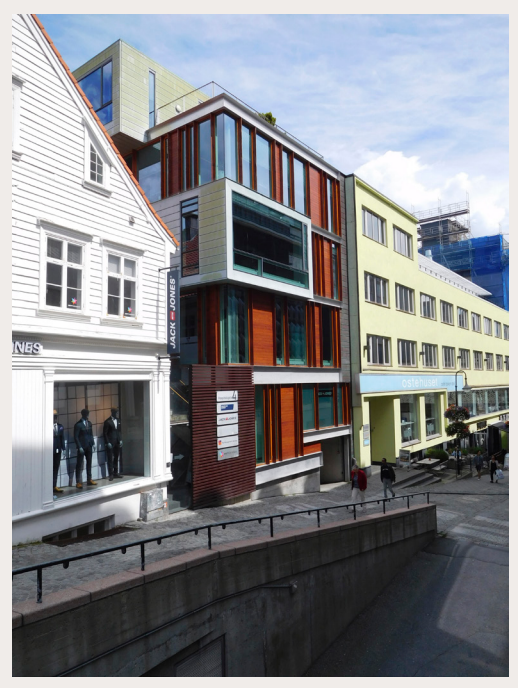
Infill building in Stavanger which harmoniously connects the Functionalist building and the historic timber building.