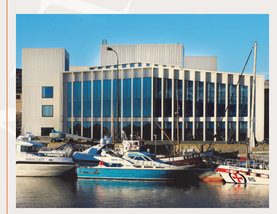
Stormen library and concert hall in Bodø. The two landmark buildings exemplify many of the positive attributes of the post-war rebuild era.