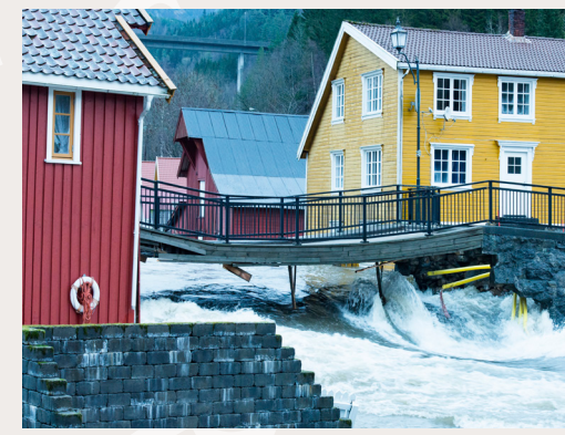
Flooding in Feda. Increased precipitation causes more frequent and heavier flooding which endangers historic buildings.

It is important to build and share knowledge, not only within the cultural heritage management, but among planners, architects, developers and other actors. Networks and various physical or digital forums that facilitate knowledge sharing, dissemination and dialogue on new information and information needs are important.