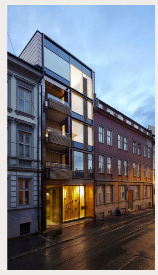
The construction of new homes on small vacant lots in existing urban environments is an effective densification strategy and serves to improve perceptions and readability. Such infill projects are also demanding and require a high standard of quality and adaptation to the surrounding architecture. In this example, the height poses a challenge.