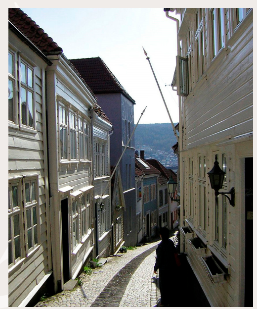
Knøsesmauet in Bergen is characteristic of streets in the historic timbered housing of this city. Cobblestones combined with compact buildings create both attractive urban spaces and attractive residential districts.

Through long-term and appropriate land-use planning, sites, monuments and cultural environments must be safeguarded and development needs accommodated. Up-to-date, integrated land-use plans and local authority cultural heritage plans are key instruments in protecting Norway's urban