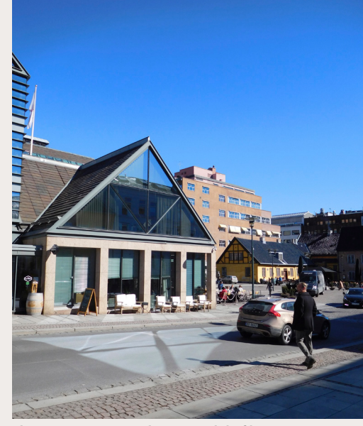
Christiania Torv in Oslo is a model of best practice in urban remediation and blending the new with the old.