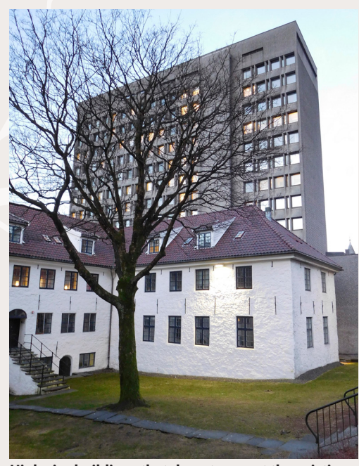
High-rise buildings that do not respect the existing skyline and prevailing dimensions rarely result in harmonious urban environments. The photo shows Bergen city hall.