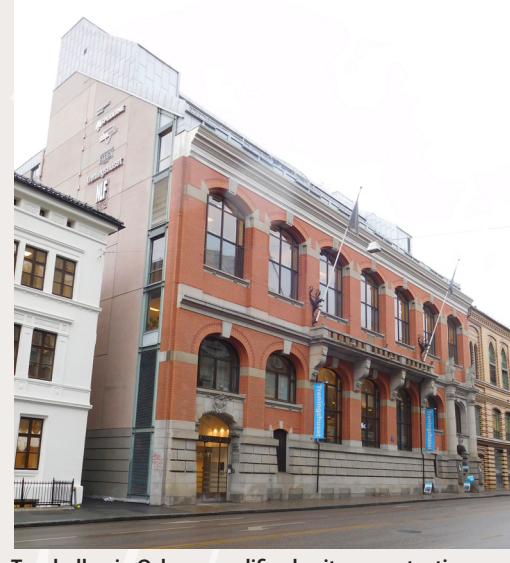
Turnhallen in Oslo exemplifies heritage protection values linked to experiential values. Following a fire in 1988 that gutted the interior of the building, a new building was erected behind the preserved facade.

Increased climate impacts mean that proper and appropriate maintenance and preventive measures will be even more important than in the past. Risk and vulnerability assessments should be performed for historic urban environments and preservation-worthy buildings. This should be followed up by effective management and intervention when damage cannot be avoided. The cultural heritage management authorities should cooperate closely with other sectors to put in place emergency response systems and in order to plan and execute preventive measures.