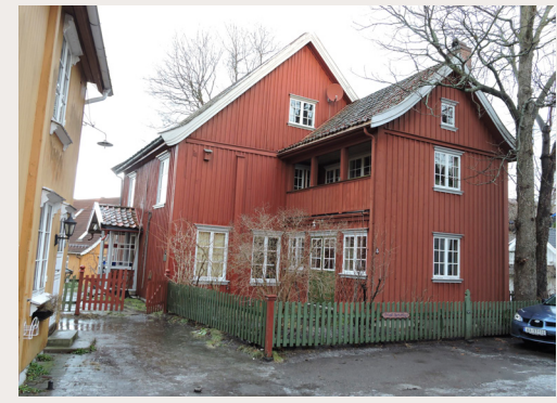
The extension to this residence in Drøbak is a positive example of reiteration of the vernacular architecture and building materials.