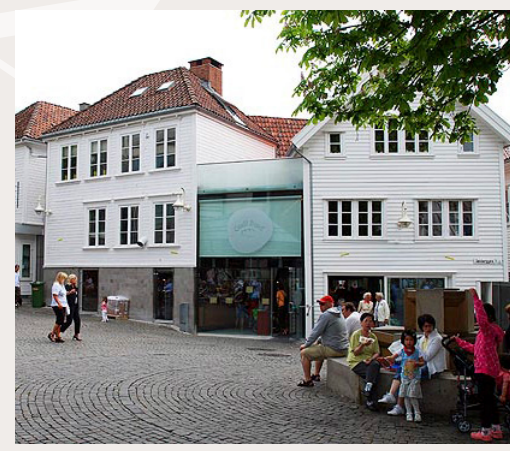
Godt Brød AS at Sølvberget, Stavanger. Arkitekt Helen & Hard. A good example of an infill project in which the compact newbuild offers a positive contrast to the adjacent buildings while being lesser in volume.