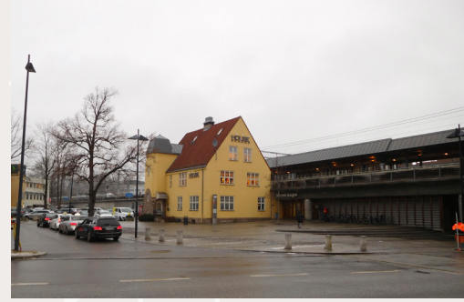
Skøyen station in Oslo is a historically important landmark that serves to define a historic hub.