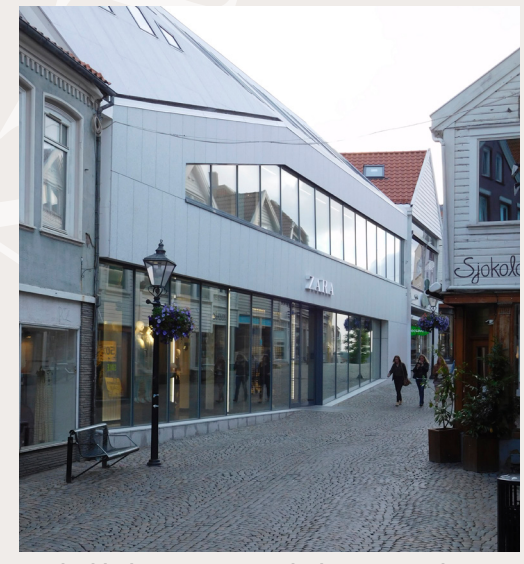
Newbuilds that present a marked contrast to their environs in Stavanger city centre.