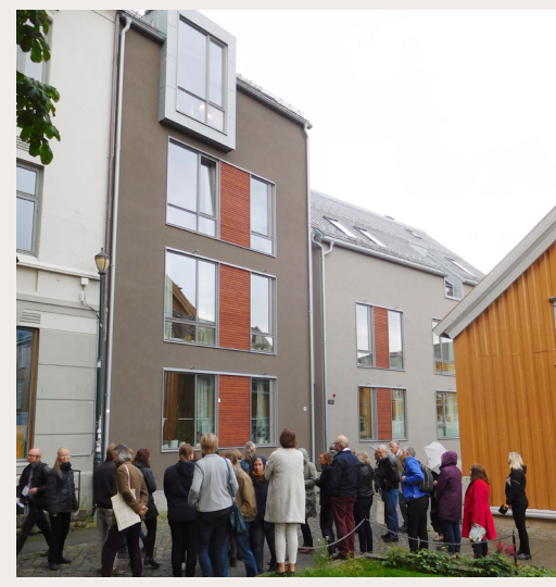
This newbuild in Trondheim received the local authority's building excellence award for its successful architectural blending. The building adopts the dimensions and roof designs of the surrounding architecture.