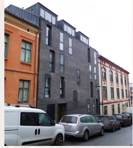
Newbuild in the Grünerløkka district, Oslo. The building contrasts with the adjacent buildings, but the high quality of the exterior design, choice of materials and adapted volume make the project acceptable.

Proactive clarification and clear communication of cultural heritage values pave the way for good solutions and are a precondition for the predictability of the cultural heritage management authority in planning and building applications.