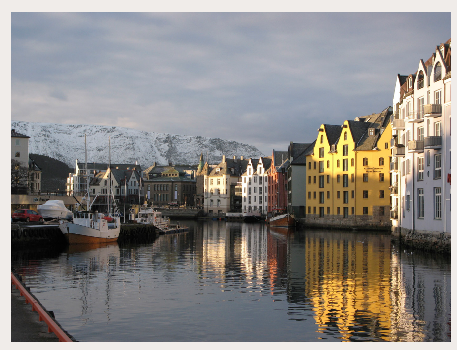
The well-preserved Art Nouveau architecture gives Ålesund its historic character.