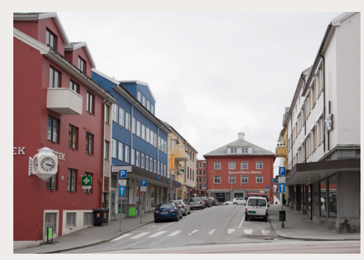
Architecture in Kristiansund from the early post-war period gives the town its distinctive character and attributes. The urban planning for the early post-war rebuilding project emphasised sightlines, street layout and meeting places.