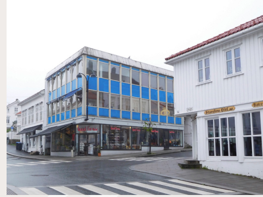
Buildings that contrast with the surrounding architectural environment have subsequently proved dysfunctional. This example is from Risør.