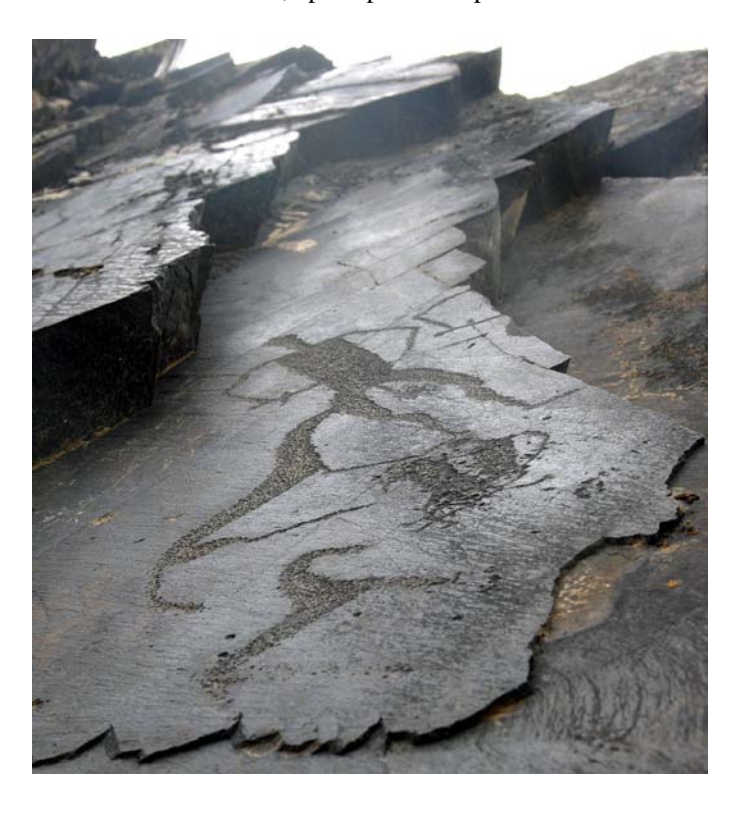
Horses and anthropomorphs in Saka-Scythian animal style.