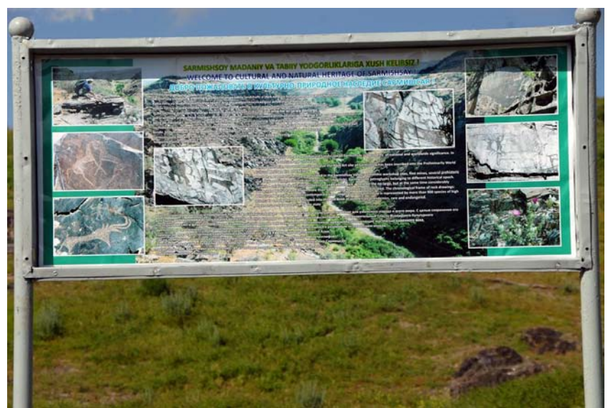
The new information signpost at the south entrance to the site.