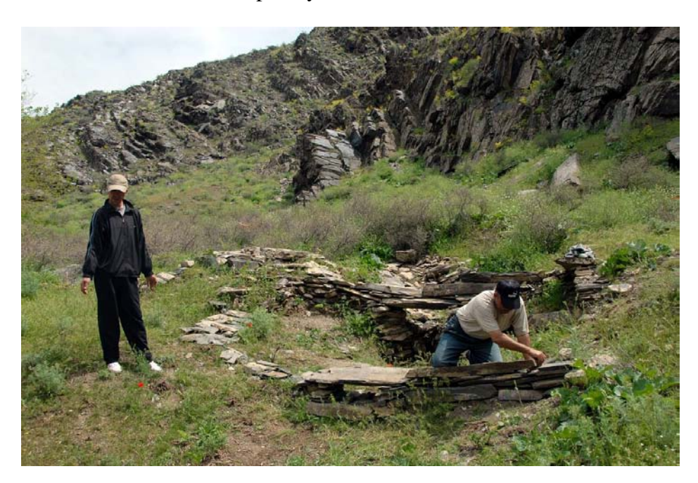
Work is underway to restore an old water mill (route 2, point 7).

At oblast level, the function of the Museum-Reserve and a set of statutes for the Director and his office were not completely defined at the time of our visit.