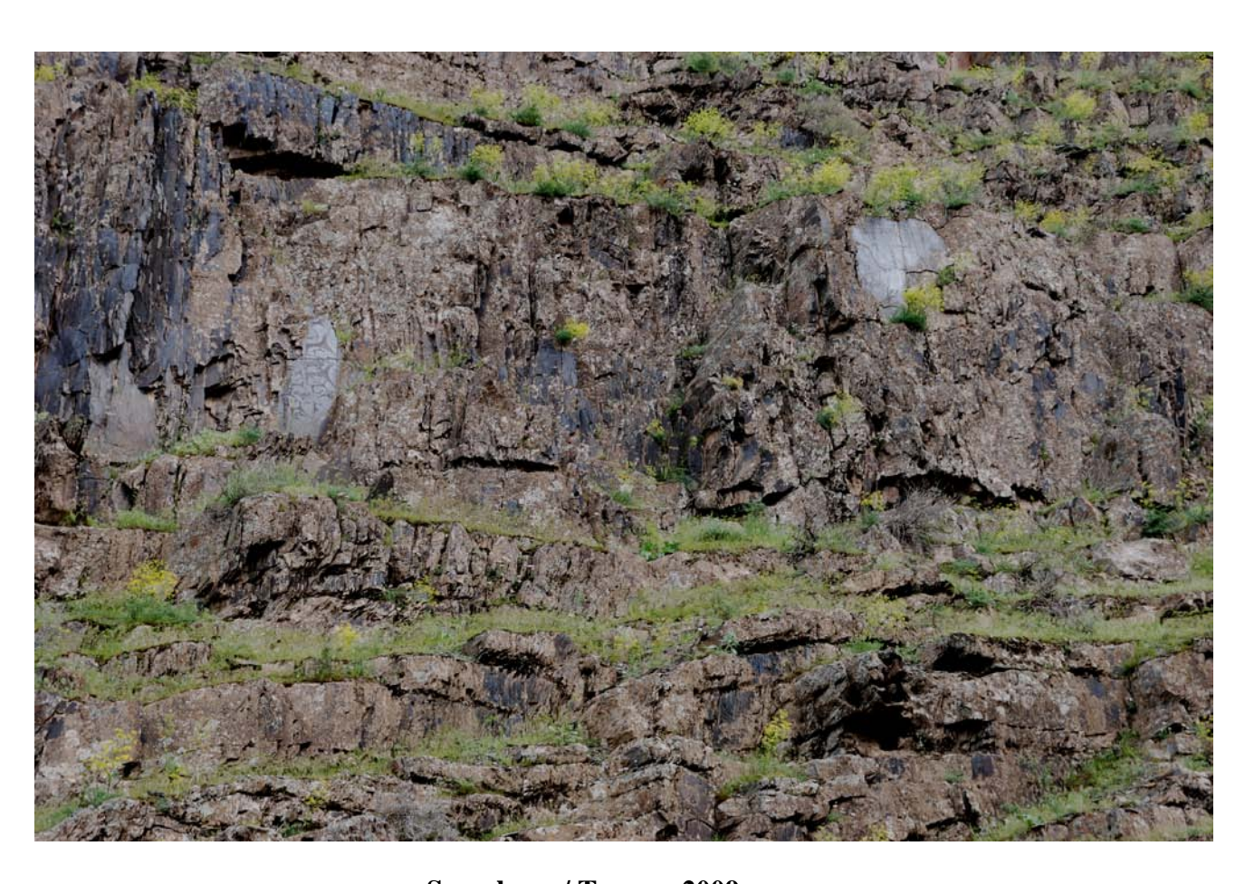
Sarpsborg / Tromsø 2009