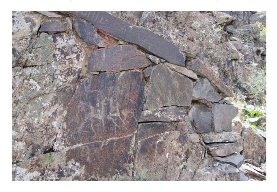
Protective works on Group IX (cf. photo in the Norwegian report from 2007, page 15).

Route 2 ends when descending from Group VII and over new bridge, to be built at the place decided before but not yet made (see Norwegian report from 2005, page 11).