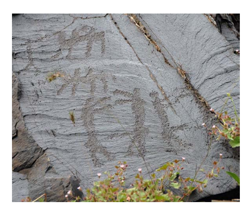
Camels and dancing (?) men, visitors' route 3.