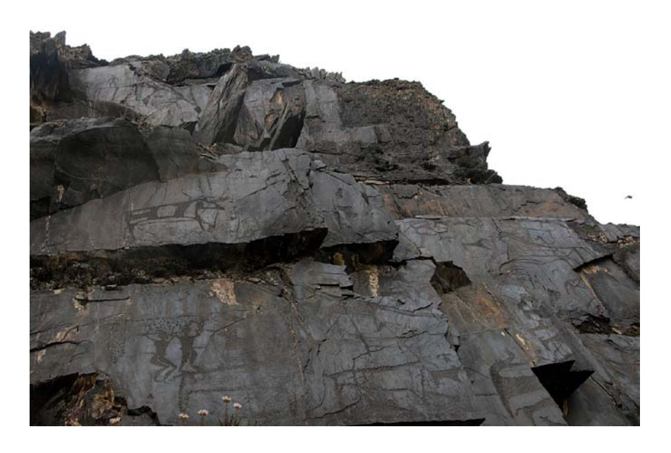
The upper part of Group VII constitutes the finest panels on the second route.

In order to push the project forward a set of preconditions were defined following the Norwegian visit in 2008 and during the visit in 2009. Results reached as of 30 June 2008, to be reported by 15 July, were made the condition for further project support, provided that the N-MFA decided to allocate funds for another project year, 2009-2010.