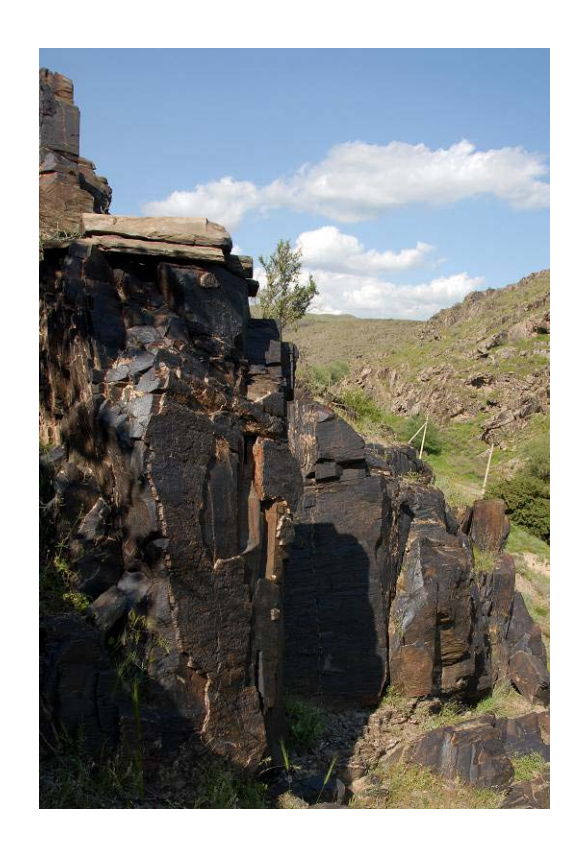
The small slab roof over group VII.

Monitoring routines are carried out and the routines work well.