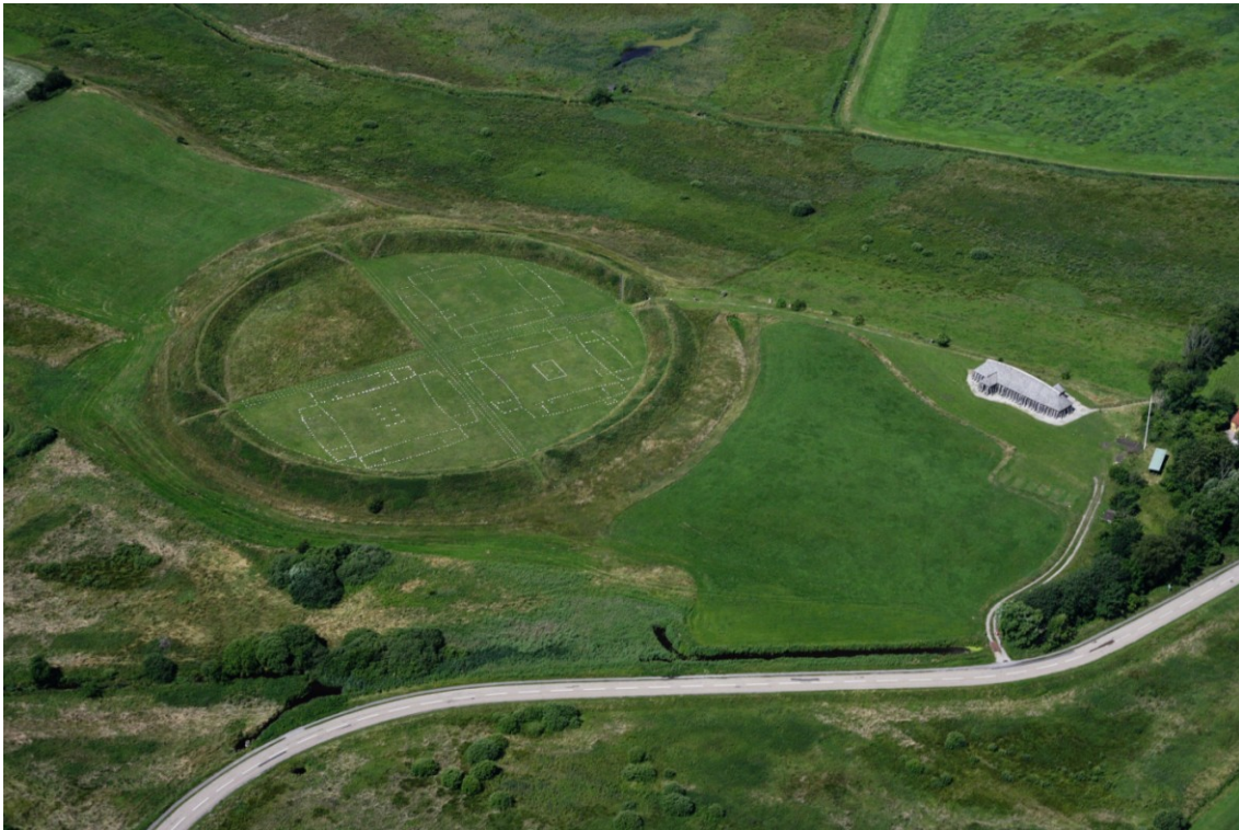
Figure: Fyrkat.

Roskilde Museum, St. Ols Gade 15, DK-4000 Roskilde, roskildemuseum@roskilde.dk ; www.roskildemuseum.dk