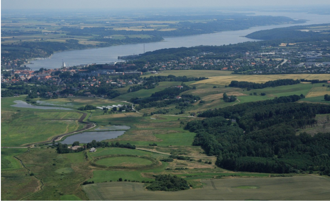
Figure: Fyrkat, Hobro, and Mariagerfjord.