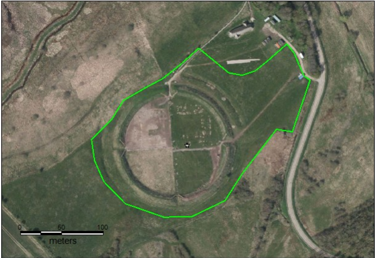
Figure: The fenced area.

The property constitutes an important element in the Danish Agency for Culture's updating of prehistoric monuments in Denmark – in a tangible form via the project 'Danish Prehistory in the Landscape', which aims at restoring the property and presenting its history by way of on-site signboards as well as through text, pictures, and sound via digital platforms. The stories are presented on-site by way of a completely new national signboard concept that has been developed in co-operation with the Danish Nature Agency and the Agency for Palaces and Cultural Properties. The signs provide an explanation in Danish, English, and German of time period and the actual locality. In addition, a small symbol guide has been developed. The digital part of the project is accessible as a part of the Danish Agency for Culture's other presentation and communication projects.