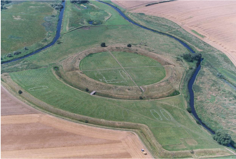
Figure 4.3 The Trelleborg fortress with the circular rampart, ditch, and buildings marked or recut ©Viking Fortress Trelleborg/Anne-Christine Larsen.