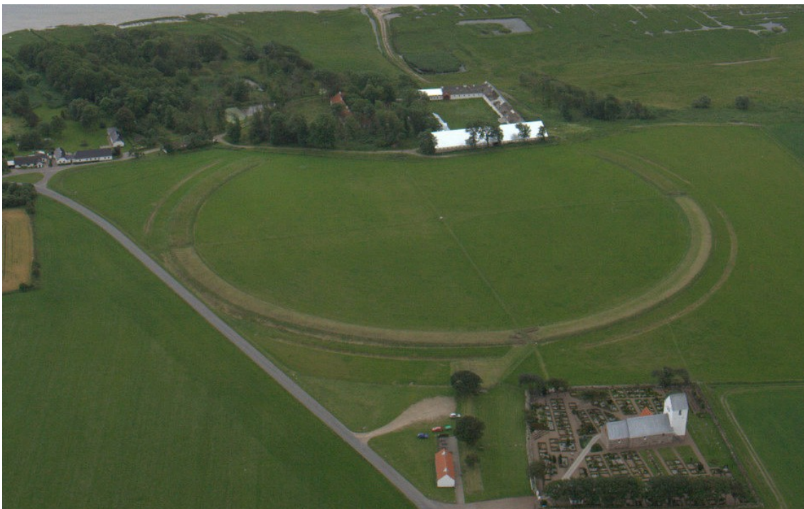
Figure: Aggersborg.

The National Museum of Denmark owns the protected area and the reconstruction of the Trelleborg house. The Trelleborg Viking Fortress/the National Museum of Denmark monitor the fortress area daily. In addition to grazing by sheep, the sloping sides of the rampart are cut twice yearly with special mowing machines in a gentle and effective way, which ensures minimal erosion and wear. The protected area is fenced, and this hinders most vehicular access as well as controlling the entry of cattle to the area. There is, however, easy visitor access to the area. The Trelleborg Viking Fortress carries out the necessary care and maintenance of the area. Maintenance has mostly consisted of mowing the grass with special machines on the rampart and grazing by sheep. A delicate balance has been found between the number of grazing animals and the need for grazing; this means that the fortress is not exposed to excessive erosion.