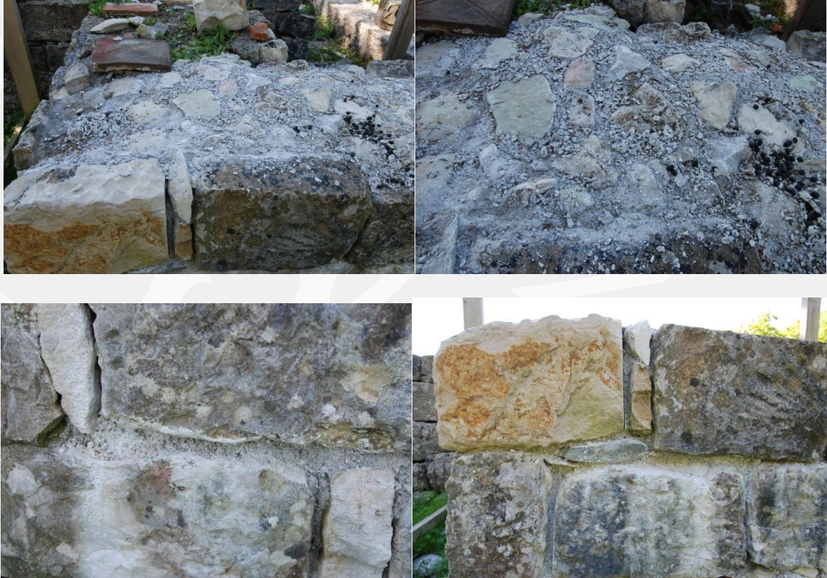
Details of parts of the wall top and pointings of the north-east conserved corner of the the King's Bath.