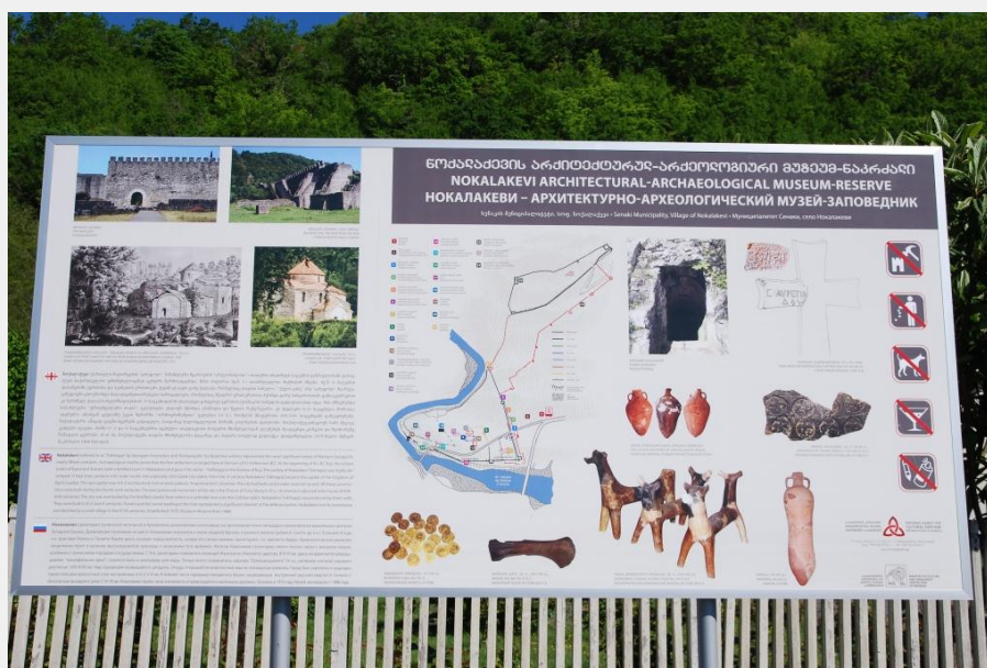
The new, large information board by the entrance to Nokalakevi Museum.

Preparations for Management Action Plan 2 – Conservation started through a detailed study of each monument during the workshop, but the plan itself was not prepared. The first draft of the English translation of this Action Plan was finished by the end of May and after some rounds back and forth between Georgia and Norway, it was altogether finished in June.