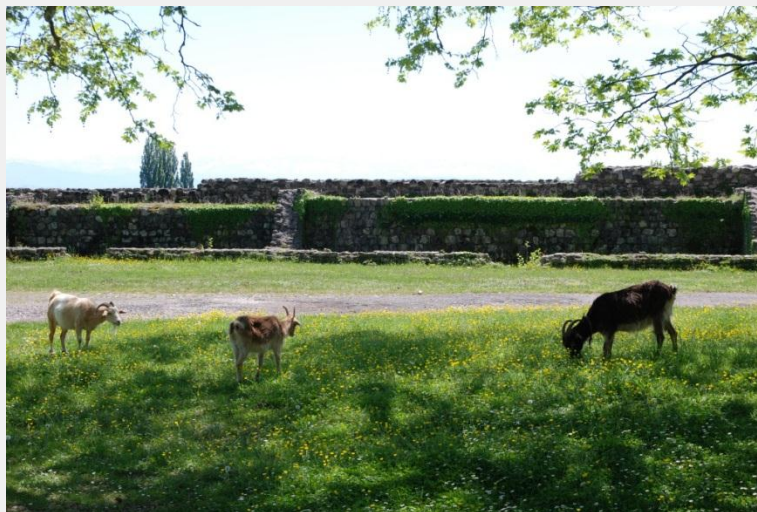
Vegetation is growing in and out of stone walls and represents a serious conservation threat. The south part of the Complex, the walls of the Garrison.