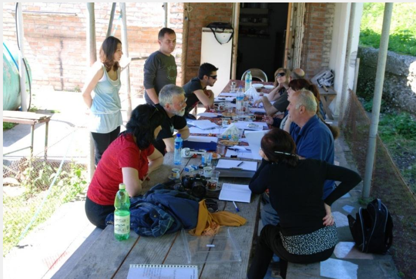
Workshop participants working on the Management Plan at Nokalakevi field station.