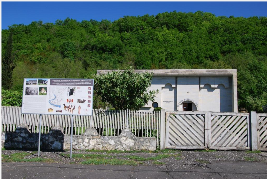
New information board in front of Nokalakevi Museum (see also page 18).