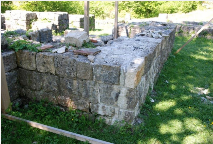
Overview of the north-east conserved corner of the The King's Bath.

As we observed in April 2012 the result was not at all satisfactory. While the mortar in the vertical pointings looked fairly acceptable, the mortar on the wall top was seriously cracked, crumbled and dissolved. Below the loose bits, the mortar was still soft and obviously had not hardened as it should. There may be several reasons for this unfortunate result which obviously must be further studied and discussed (see also the September 2011 conservation report, pp. 7-8).