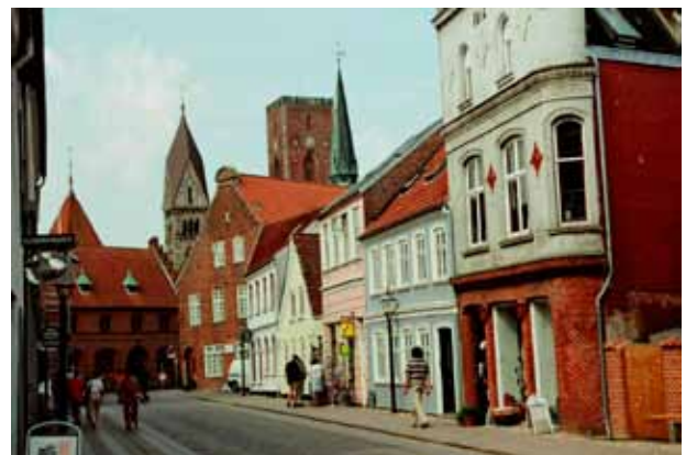
Ribe with the cathedral in the background.

Today this part of the coast is probably one of the best protected in Denmark, with altogether more than 20 kilometres of dikes. The dikes are about 12 metres across at the base and 2.5 metres at the top and rise about 7 metres above the normal water level. They were first built in 1924-25 and later extended in 1978-87. Jutland also has its own storm flood contingency measures. The cultural heritage site of Ribe is therefore now well protected against the rising sea level and storm tides.