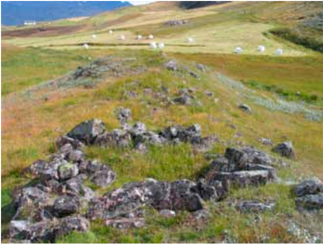
Modern agriculture and ruins of Norse settlement, southern Greenland.

The climatic basis for an expansion in agriculture will be greatest in marginal areas. For example, a warmer climate in Arctic areas will mean better conditions for agriculture in southern Greenland. If this results in new cultivation and more intensive operations, this will represent a threat to ruins, middens and fields from the Norse culture. Today's farmers use the same areas as the Norsemen did and the conflicts could increase between preserving heritage sites from the Norse period and present day agriculture.