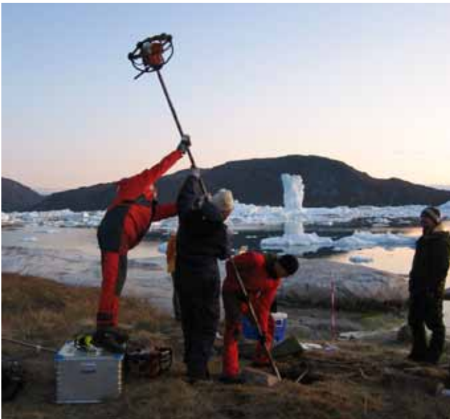
Installing equipment for local monitoring of soil temperature, thawing, and the water content of frozen layers of archaeological deposits. Qajaa, Greenland.

heritage site to check whether it is intact, damaged or lost. The reason for any damage or loss is recorded at the same time. The situation is documented by means of photographs and the location is determined digitally, if this has not yet been done.