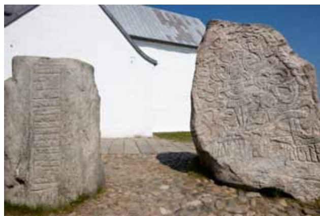
The two runestones at Jelling will be protected by a building.

long term, global warming will mean that Denmark experiences fewer freeze-thaw cycles. In future therefore, stone heritage objects will be less vulnerable to frost damage than they are today. However, the present situation of the runestones at Jelling is assessed to be “extremely critical” for the small stone and “worrying” for the large one. It has therefore been decided to erect a protective building around the two Jelling stones to protect them from further climate impact, while eliminating any need to move the stones.