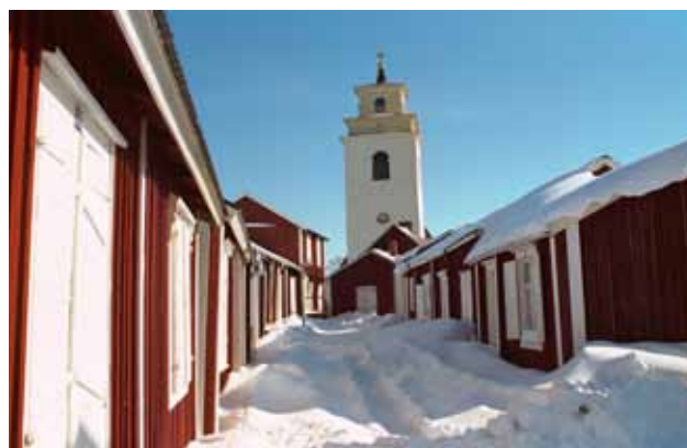
Gammelstad "church town" with Nederluleå Church in the background.

Gammelstad is near the coast of Norrbotten. Climate prognoses to the middle of this century indicate a substantial increase in average temperatures: about 3°C in winter and about 1°C in summer. Precipitation is expected to increase by about 10-20% in the autumn and winter, mostly in the winter. This will mean warmer and damper winters, wetter autumns and more meltwater in spring. General warming has already occurred, according to measurements taken over the period 1991 to 2005. Even today, the changes can be traced through finds of the true dry rot fungus ( Serpula lacrymans ), for example, which was previously unknown in the area.