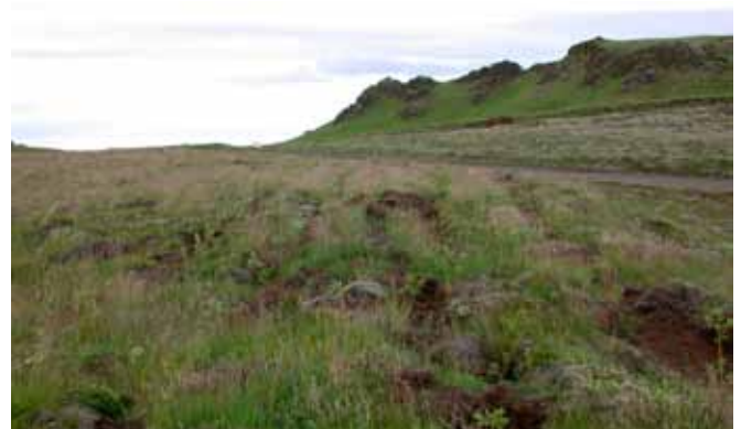
The protected archaeological site of Biskupagarður in southern Iceland was being ploughed up for tree planting before the work was stopped.

Since Iceland was first settled, 95% of its forest has probably been lost and soil erosion has become a major problem. Forest planting and reseeded of eroded areas are therefore being used on Iceland as important climate measures that receive considerable state support. Forest planting can, however, conflict with the conservation of archaeological sites. In many of the areas where trees are being planted, heritage sites have not yet been recorded. In some places trees have also been planted in areas with protected ruins. The introduction of larger trees like aspen and conifers from Europe and America has increased. These trees often have larger roots than Iceland's natural mountain birch and can therefore do great damage to archaeological sites.