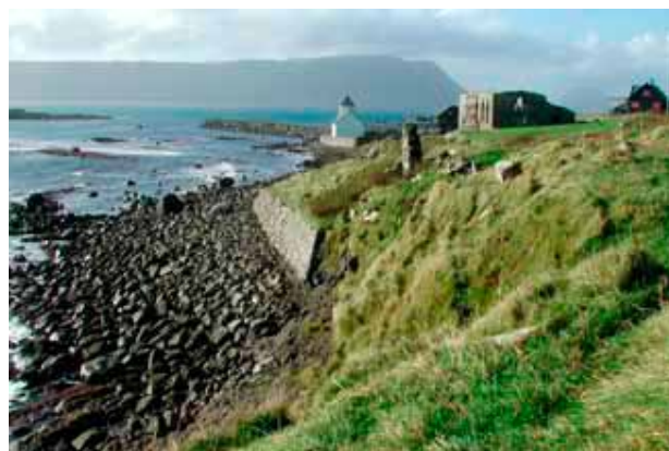
Kirkjubøur with the remains of Likhús church in the foreground, the white parish church to the left, and the ruins of Magnus Cathedral to the right.

In 2008, a policy for the conservation and maintenance of the ruins was devised. One of the measures will be various forms of coastal defences. However, a basic prerequisite for conservation work in general will be to record areas vulnerable to erosion where valuable cultural heritage sites are in danger of being lost.