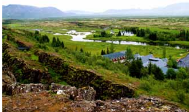
Both natural mountain birch and introduced spruce grow in Þingvellir National Park.

The management of Þingvellir National Park has therefore devised guidelines for handling vegetation at the site. Species that do not belong to the natural flora of the location are being removed and trees and other growths that could damage archaeological traces or make them difficult to see are kept under control.