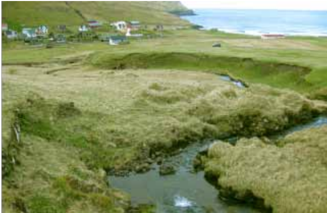
Medieval ruins are threatened by river erosion in Húsavík.