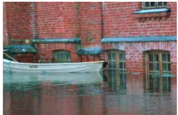
Flooded factory building, Verla.

Long periods of rain are especially critical for Verla. The water level in the power station's chutes rises high above the windows of the pulp mill and water penetrates the structure. New high water levels have been ever more frequent in recent years. Preventive measures have been set in motion, but the risk of flooding is imminent.