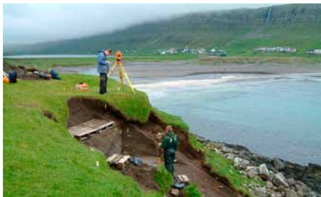
Archaeological excavation of the eroding cliffs in Sandoy, Faroe Islands.

can be given to archaeological excavations in erosion-threatened areas both on land and under water. There are also other examples of models for financing archaeological excavations in threatened locations. In the Faroe Islands, surveys were made of the eroding cliffs at Junkarinsfløttur and á Sondum in the settlement of Sandur at Sandoy between 2003 and 2007. This project was financed jointly by oil companies and the Faroese research fund.