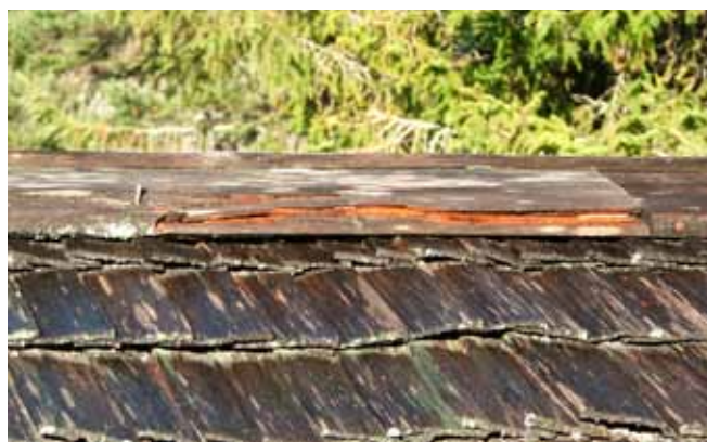
Damage by rot to the roof of a medieval loft in Fyresdal, Telemark.

Moisture is a basic precondition for the growth of fungi in buildings. Fungal spores are found practically everywhere