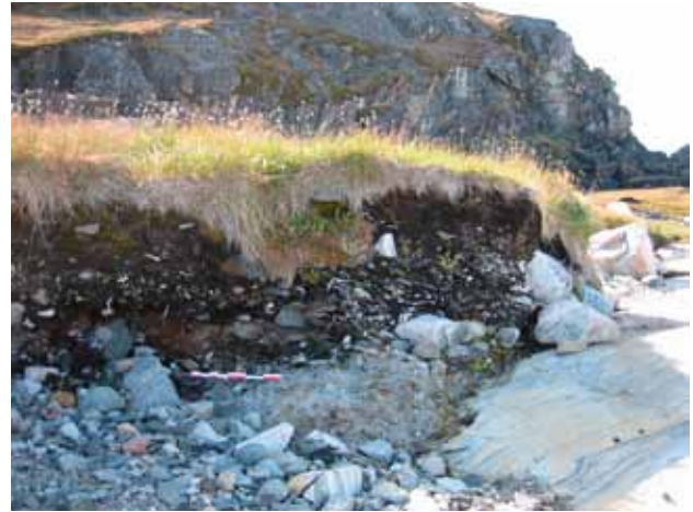
The site at Qajaa has archaeological deposits many metres thick, where the permafrost has ensured very good conservation conditions up until now.

whether the site can and should be protected, or whether it should be excavated before it is too late. Problems with rising sea level, thawing permafrost and physical erosion of archaeological layers are far from unique to Qajaa, but affect many places in Greenland..