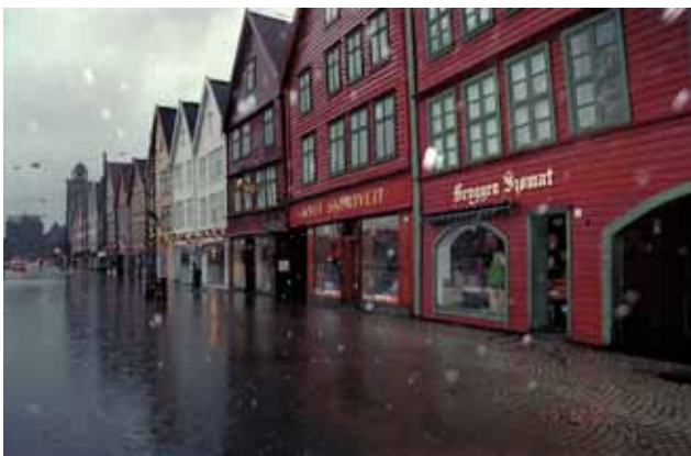
The quay of Bryggen in Bergen under water.