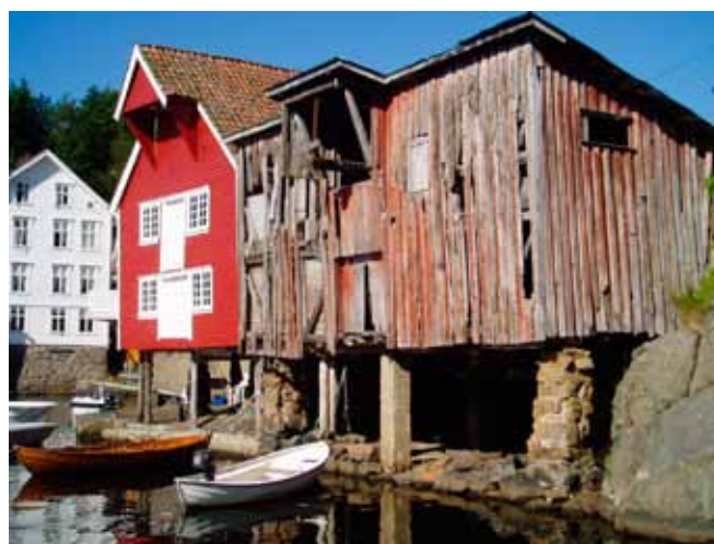
The need for maintenance and repair will increase as a result of climate change.

Documentation and maintenance plans will be useful tools for preventive maintenance. On the basis of this documentation and of earlier work, plans can be made for future maintenance that allow for increased climate impact. The use of maintenance plans in managing heritage buildings is not very widespread as yet in the Nordic countries, however. In most Nordic countries, it appears that management, operating and maintenance plans are mainly used for state-owned heritage buildings. It would also be beneficial to use such plans for other protected and heritage buildings, and following the plans would help to prevent climate-related damage.