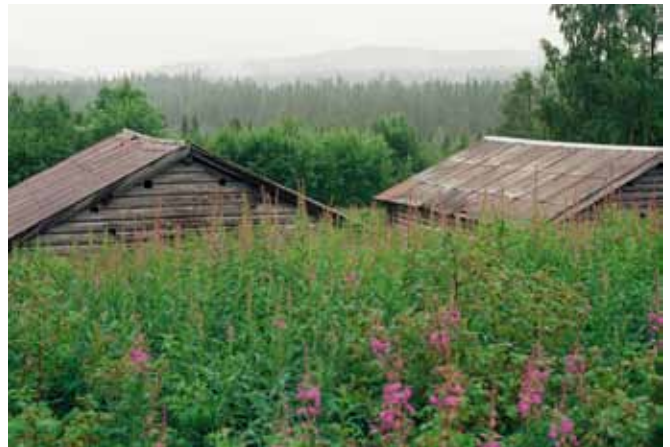
Many cultural environments linked to pasture land and summer farms are becoming overgrown. Vibyggerå, Ångermanland.

archaeological sites will be extended and that cultural environments that are not managed will become overgrown more rapidly.