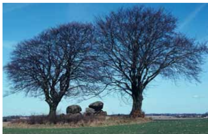
Megalithic tomb overgrown with trees, before and after a storm.

Damage to cultural heritage sites is unfortunate for their management for many reasons. Repairing damage is resource demanding, and generally speaking preventing damage needs far fewer resources than repairing it. If a cultural heritage site is not repaired after damage has occurred, this is often the first step on the path to its destruction and loss. Repairing after damage has occurred is not without its problems either. The work normally involves replacing materials or making other alterations that reduce the cultural heritage site's authenticity.